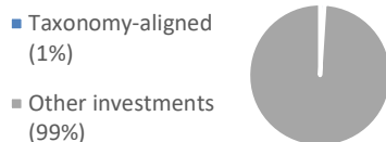
1. Taxonomy alignment of investments Including sovereign bonds*